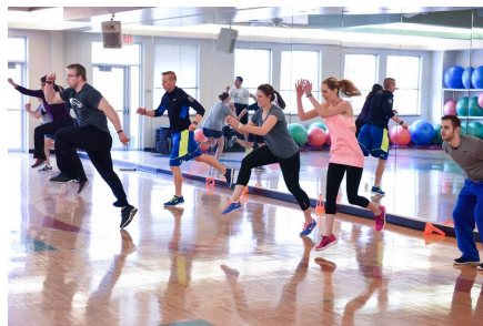
Cincinnati SportsMedicine Research and Education Foundation

10663 Montgomery Rd. Phone: 513-346-4514 Cincinnati, OH 45242 Fax: 513-792-3230